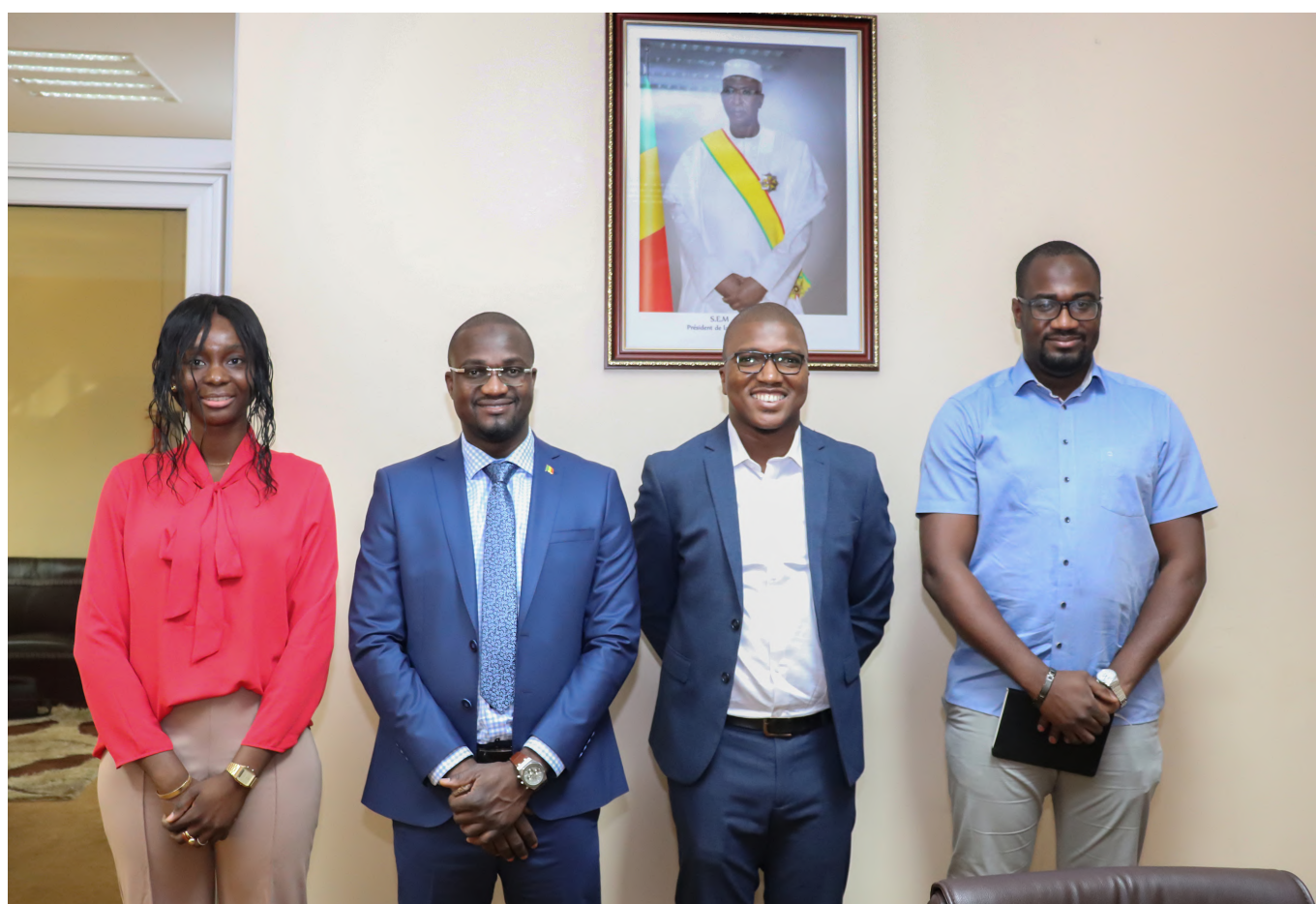
Meeting between BiD, Barrick & the Minister of Mines, Energy and Water of Mali

On Thursday, March 11, 2021, BiD had the honor to meet Mr. Lamine Seydou TRAORE, Minister of Mines, Energy and Water of Mali. The discussions were useful and constructive; Mr. TRAORE reiterated the support of his department for any initiative aimed at improving the business climate within the mining sector.